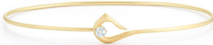
The Jade Trau diamond and gold bangle owned by Tanya Dukes

“I was instantly infatuated with this Jade Trau diamond and gold bangle bracelet. It was among a huge assortment of pieces I had selected for a photo shoot and I ended up slipping it onto my own wrist whenever it wasn’t on the model. I knew I needed to order one for myself the moment I got back home.