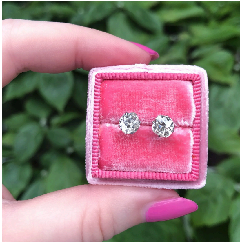
Diamond stud earrings