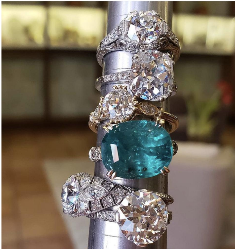
Gray & Davis mix of different centuries of engagement rings

London-based @bentley_skinner is a popular stop to see where Downtown Abbey's costume designer borrowed the cast's tiaras for the series and the film. In business since 1880 and in the same family for three generations, the shop was first invited to supply jewelry to the Royal Family in the latter years of Queen Victoria's reign. Bentley & Skinner still holds the title Jewellers by Royal Appointment to both Her Majesty the Queen and His Royal Highness the Prince of Wales. These diamond Edwardian pendant earrings, circa 1900, are a spectacular example of the shop and website's unwavering commitment to excellence in centuries of jewelry.