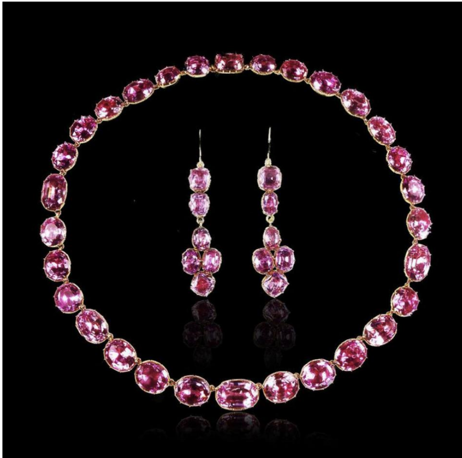
S.J. Phillips pink topaz Georgian riviére and pendant earrings S.J. PHILLIPS

NYC-based @grayanddavis ' enchanting shop in downtown Manhattan is inviting and warm in its décor and they also have an online shop. Every piece of Gray & Davis' jewelry is carefully studied, and vetted for authenticity of age and materials. The focus of the shop is on antique and vintage engagement rings and versatile, highly wearable fine jewelry from the 1700's thru the 1930's.