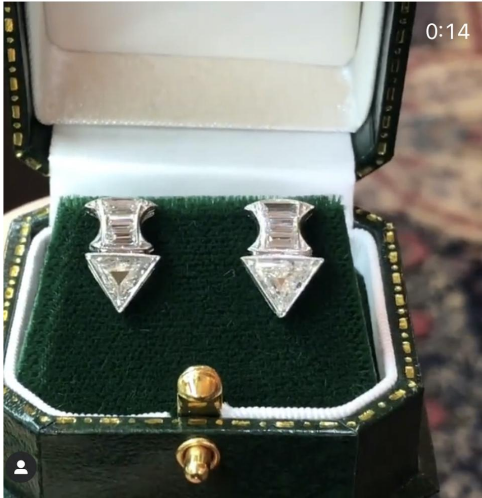
Platt Boutique Art Deco earrings PLATT BOUTIQUE