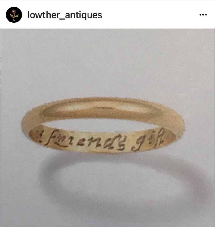
Lowther Antiques 17th century poesy ring

piece to one person, a Georgian pansy piece to another and about the stunning Halley's Comet brooches to yet another. She sells to dealers and consumers alike and her prices are accessible for starter collectors. She has a stall on Portobello Road in addition to her website. Although she doesn't post often on Instagram, it would be advisable to follow her and DM her as she has an amazing inventory and can also often find you what you are looking for as long as you give her time in which to do so. Here a photo of a ring similar to one I purchased from her a long time ago and still have. A poesy ring from the 1700s that reads "a friend's gift." And she is a gift to the antique jewelry community and one dealer you should never miss. She has also lent jewelry for the book Georgian Jewellery—a bible of sorts and to period films.