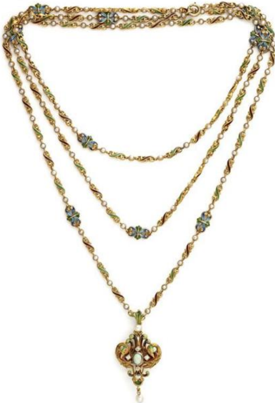
Wartski Lucien Falize necklace 19th century WARTSKI