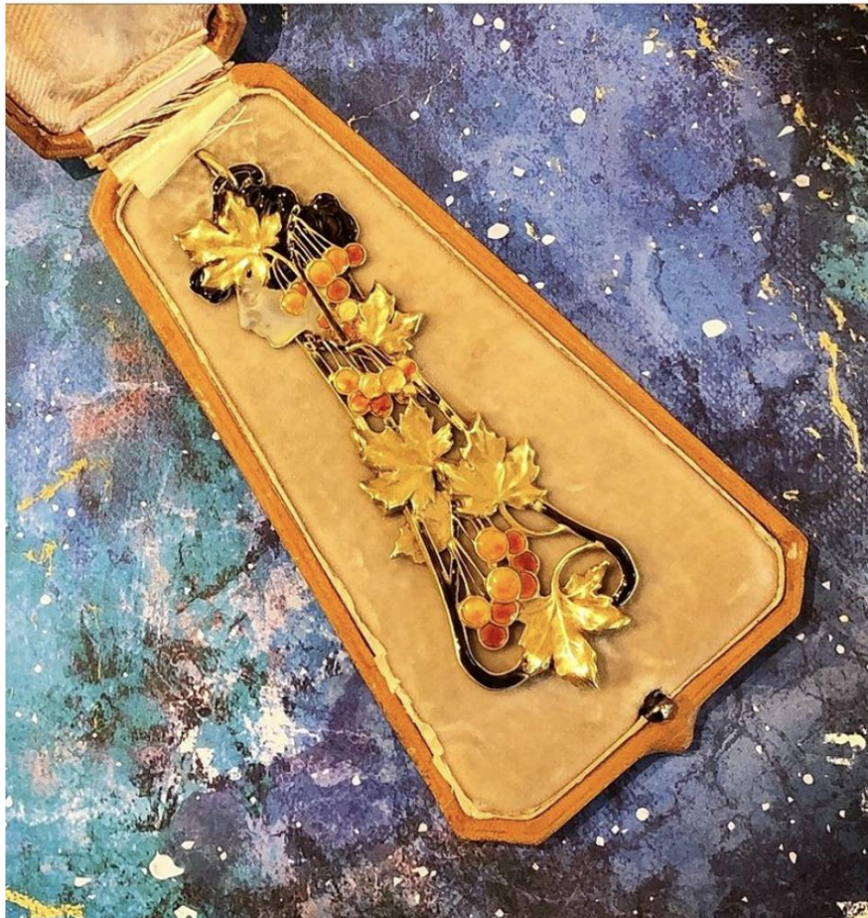
Macklowe Gallery Lalique Pendant MACKLOWE GALLERY