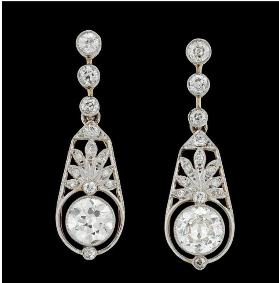
Bentley & Skinner Edwardian diamond earrings