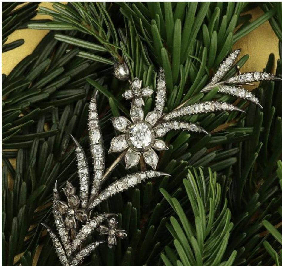
Berganza London Georgian Brooch BERGANZA