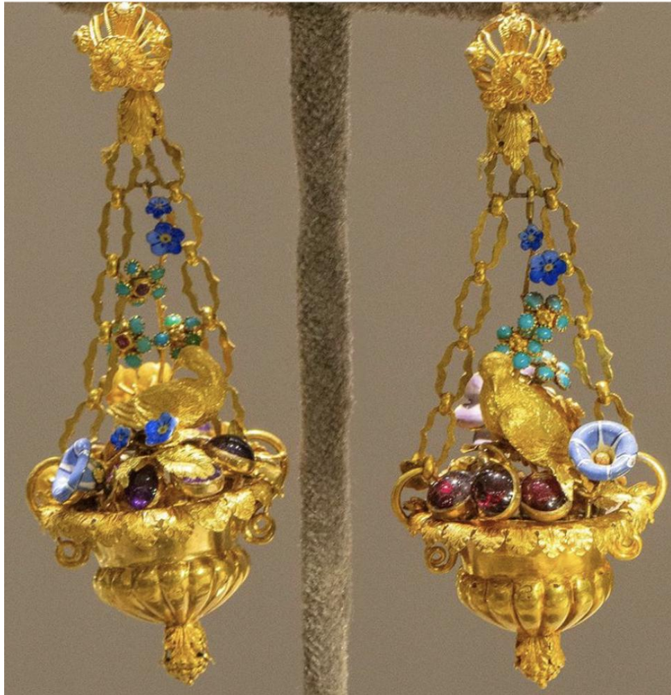
Fred Leighton Victorian Flower basket earrings FRED LEIGHTON

Manhattan based @estatediamondjewelry features a wide range of engagement rings, most predominately from the Edwardian/Belle Epoque and Art Deco periods. The company also has a range of signed jewelry from the 1920s through 1970s as well as a beautiful selection of Art Deco line and bangle bracelets. This jaw dropping 4.53-carat antique engagement ring is with its spit diamond shank is one that once you see you won't be able to get out of your mind if you are shopping for engagement rings.