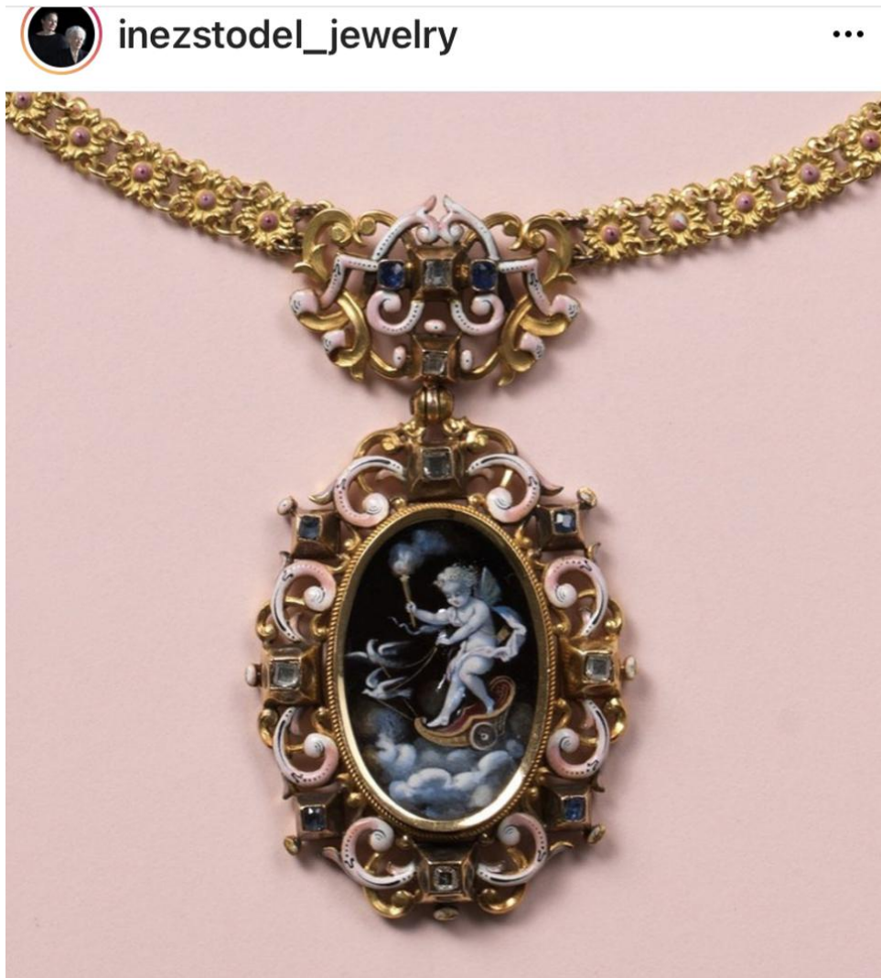
Inezstodel Jewelry's Limoge Renaissance revival pendant