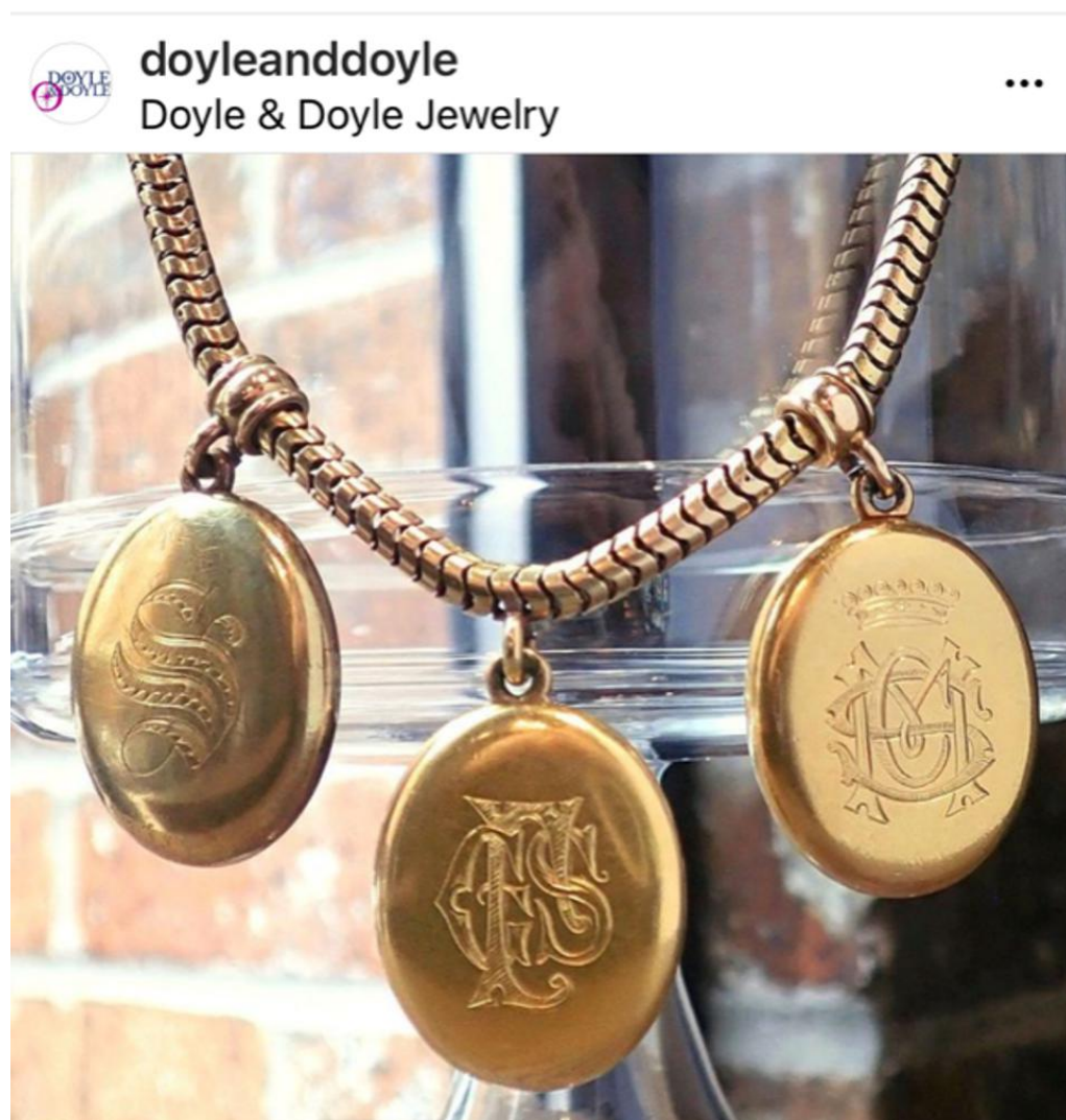
Doyle & Doyle Victorian three locket necklace with engraved monograms DOYLE & DOYLE

Manhattan-based @doyleanddoyle 's website is a veritable jewelry box of different styles that satisfy a range of demographics and customers. Emphasis is on jewelry that is wearable and that won't be tucked away in a safe with many styles hailing from the Victorian period. When it comes to engagement rings, they range from Victorian to mid-20 th century and there are also a wide variety of different periods of yellow gold chased and engraved wedding as well as different styles of eternity bands that are part of the ever evolving online shop.