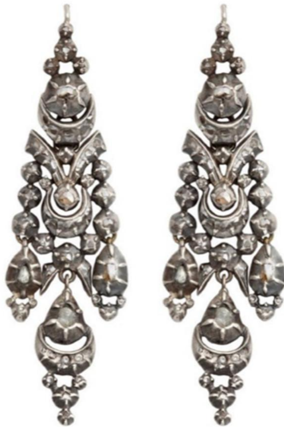
Glorious Antique Jewelry Portuguese earrings, circa 1790 GLORIOUS ANTIQUE JEWELRY