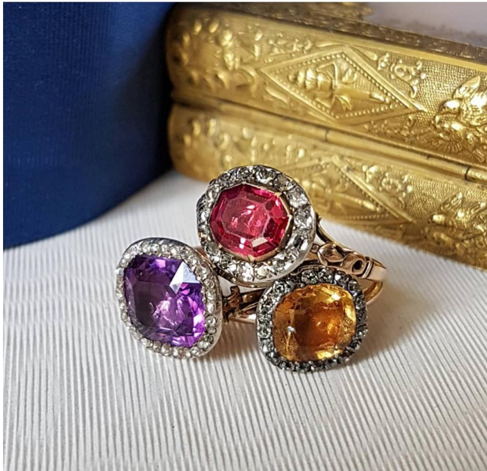
Metier Paris Georgian Rings METIER PARIS