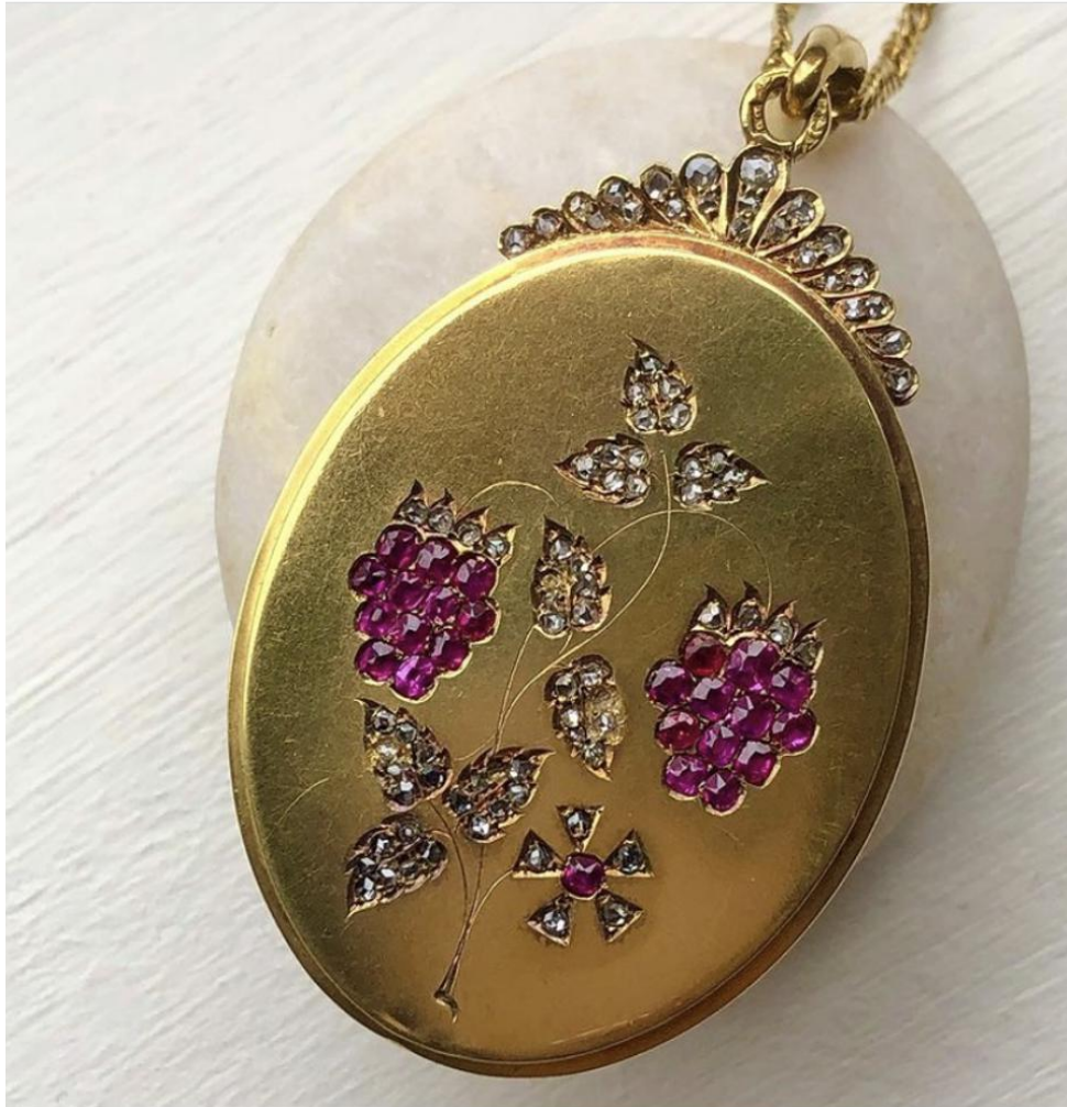
Keyamour Grape and leaf locket KEYAMOUR

Manhattan-based @Leightonjewels ' (Fred Leighton) selection comprises what antique dreams are made of. Rebecca Selva not only curates an amazing array of jewelry but she's a born stylist with a strong design sense and creativity that is unparalleled when it comes to mixing up different centuries in layers of necklaces, or scattered brooches. She also knows an awe-inspiring find when she sees one such as these enamel and gold flower basket earrings with bird perched on top of them.