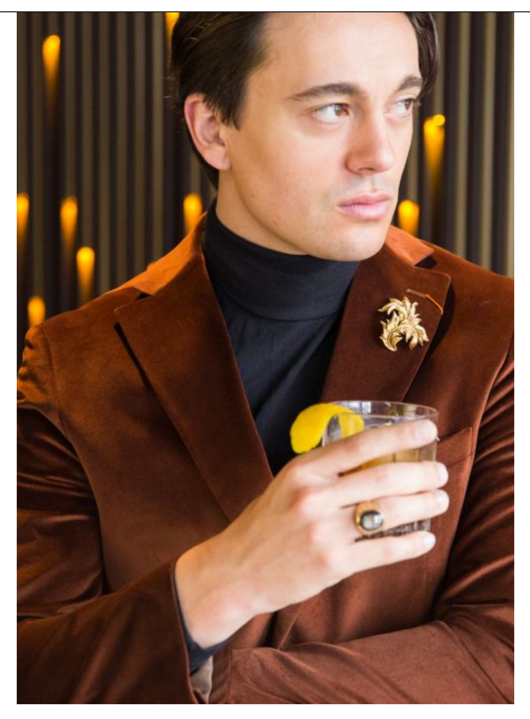
Vintage stone ring and brooch on lapel from Lang Antiques.

These styles may never surpass watches and wedding bands as main staples in men's jewelry, but it definitely offers the ability to be more creative and confident."