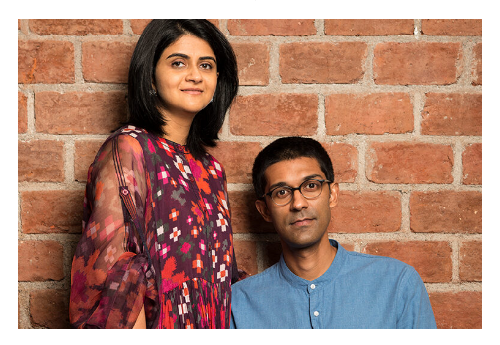
Studio Renn: Using Grey Matter