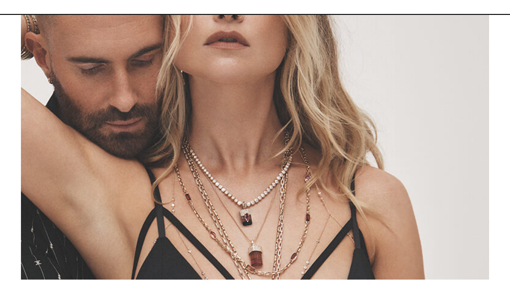
Jacquie Aiche Launches New Rebel Heart Campaign