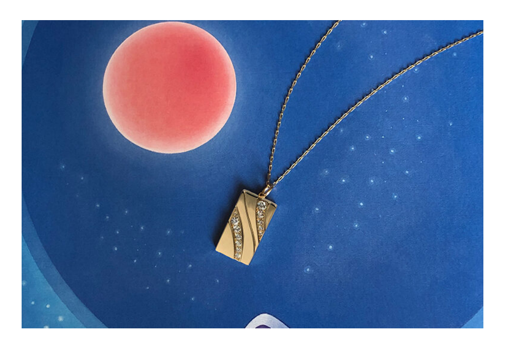
The Luminaries Shining Bright at Couture